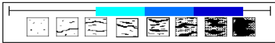
this scale bar shows the meaning of the distribution terms at the current time